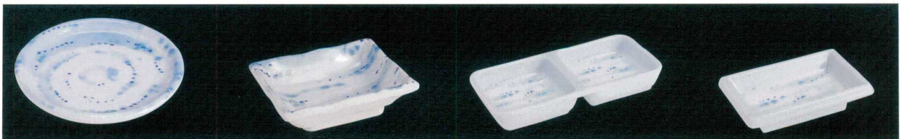
9-729-14 ¥800 小皿 うず潮 1704UZ [M] φ103×14 8-729-14