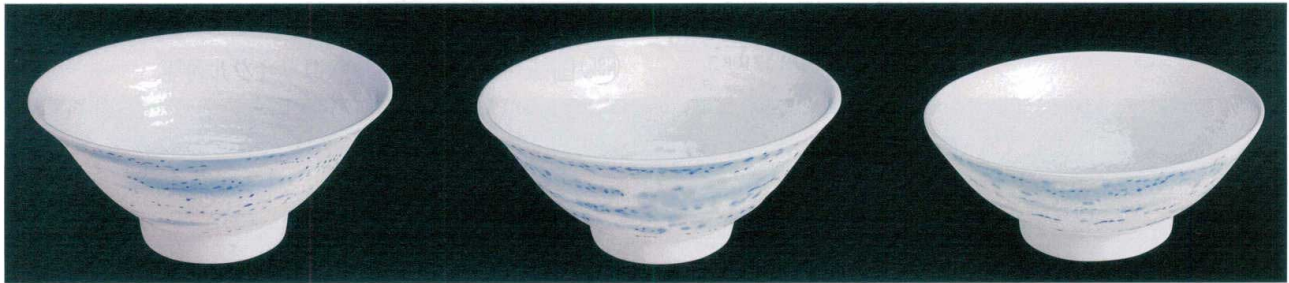
9-729-3 ¥2,150 19.5cm 麵丼 うず潮 5780UZ [M] φ192×85 8-729-3