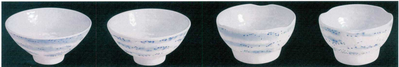
9-729-6 ¥1,800 飯丼 うず潮 5706UZ [M] φ148×70 8-729-6