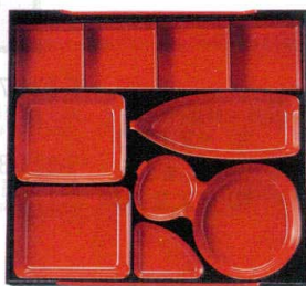
5-820-2 ¥1,000 尺3 気比用四ツ切仕切 朱 [A] 3-384-2 (21002410)