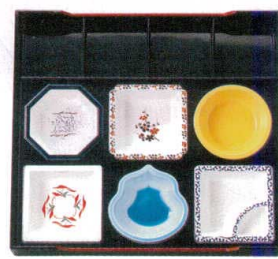
5-820-4 ¥800 尺3 気比松花堂用四ツ切仕切 黒 [A] 3-384-4 (21002380)