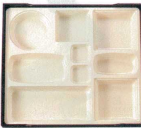
5-820-7 ¥2,200 尺3 角気比用幕の内仕切 クリーム [A] 3-384-7 (21002455) 354×327×36