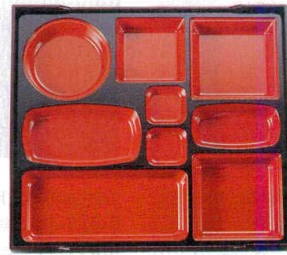
5-820-8 ¥2,400 尺3 角気比用幕の内仕切 朱天黒 [A] 3-384-8 (21002450) 354×327×36